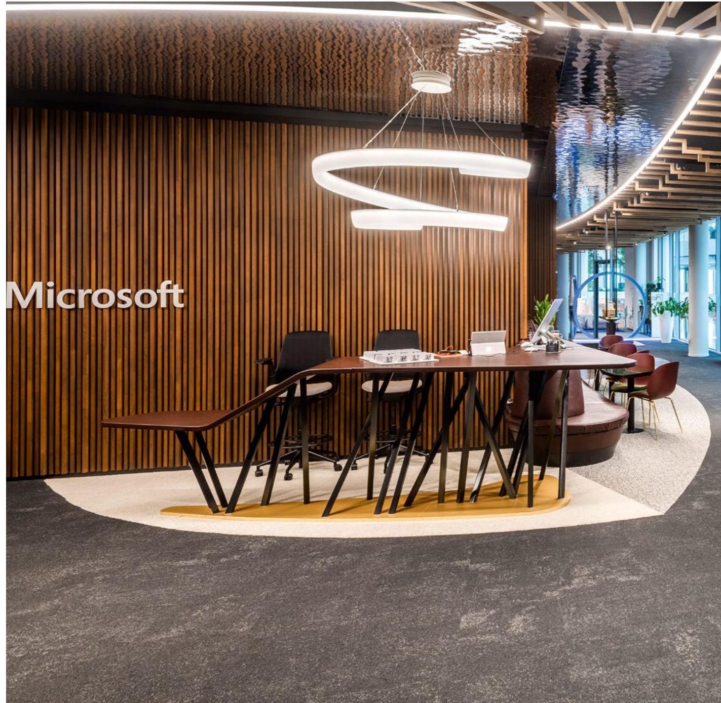
OFFICE | MICROSOFT | CONCEPT & DESIGN: PROCOS GROUP BRUSSELS | BELGIUM