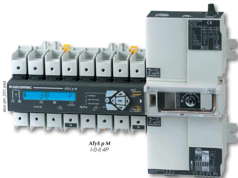
ATyS p M I-O-II 4P

Automatic Transfer Switching Equipment from 40 to 160 A