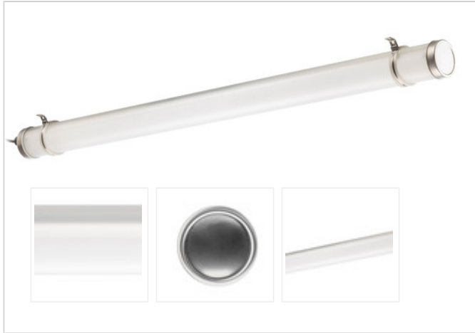
TUBIS N LED