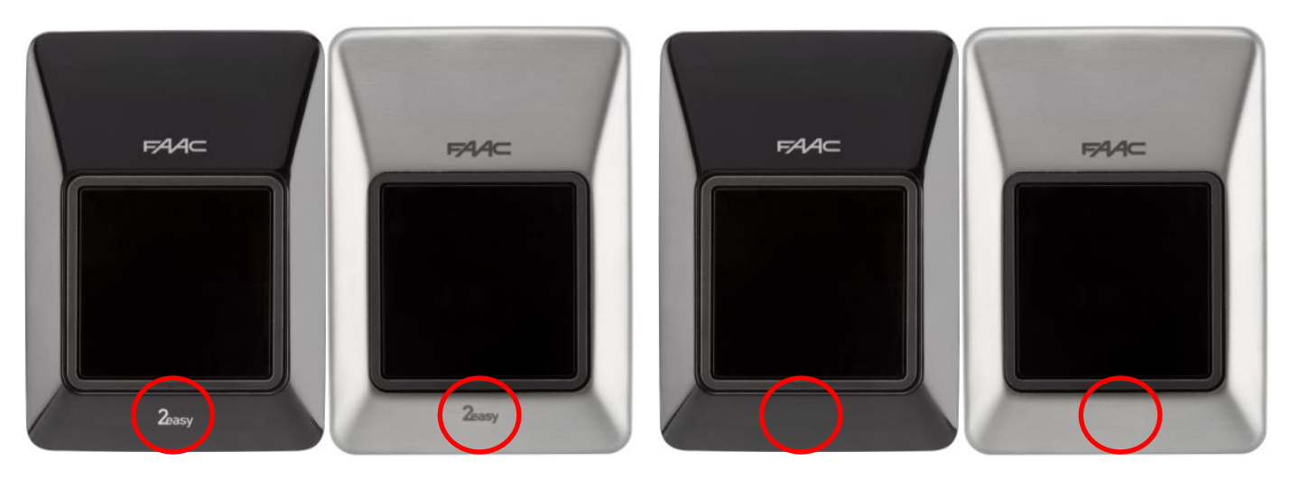
BUS 2-Easy versions (logo)

In both plastic and INOX versions, the technology applied, can be easily identified just checking the front cover, with no need to open it.