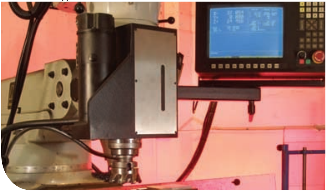
Typical applications for type FSU conduit and fittings include general factory wiring.