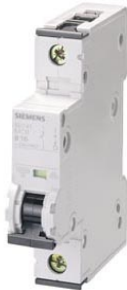
CIRCUIT BREAKER 230/400V 6KA, 1-POLE, C, 6A, D=70MM