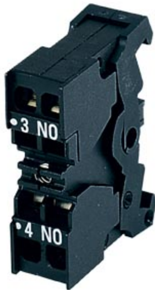
ACTUATOR-/INDICATOR COMPONENT CONTACT BLOCK WITH 1 CONTACT ELEMENT SPRING-LOADED TERMINAL, 1NO