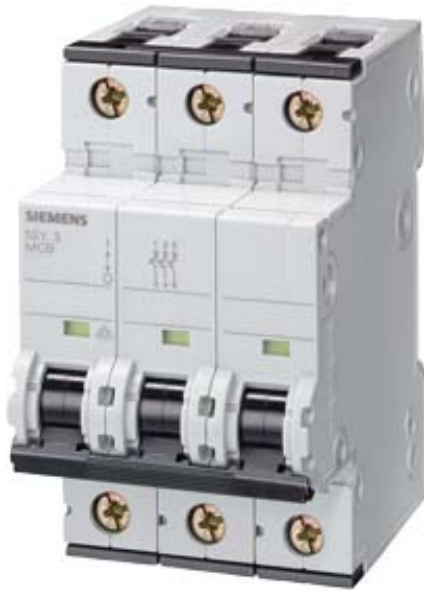
CIRCUIT BREAKER 400V 10KA, 3-POLE, C, 16A, D=70MM