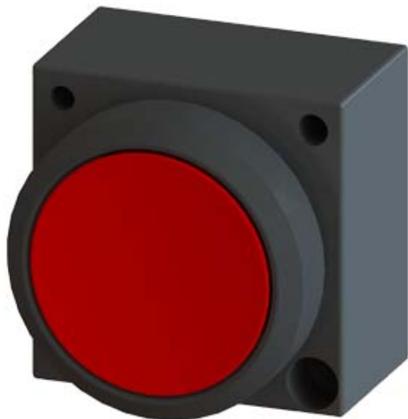
22MM PLASTIC ROUND ACTUATOR: PUSHBUTTON WITH FLAT BUTTON WITH HOLDER RED